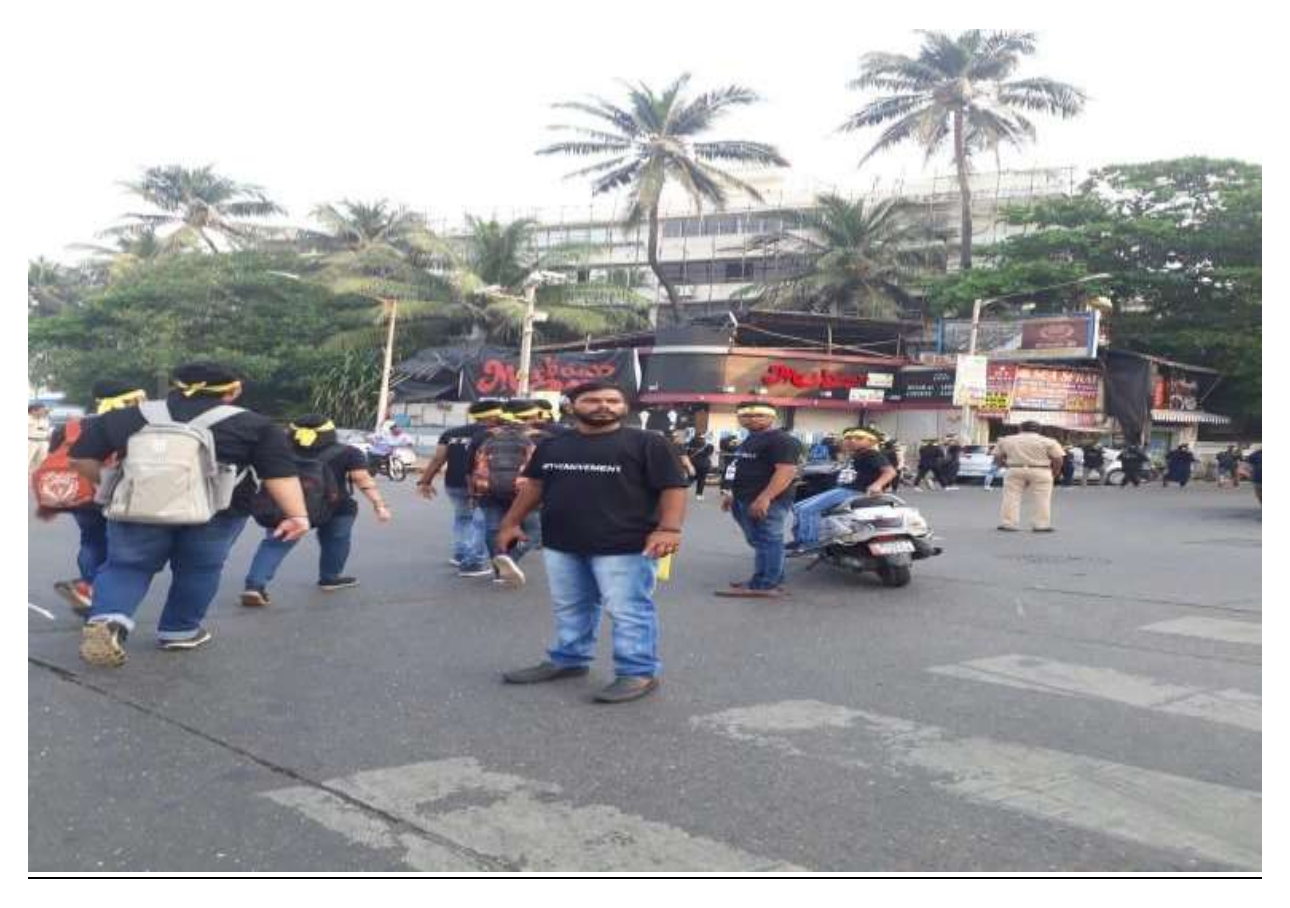
Blood Donation Camp – 2019