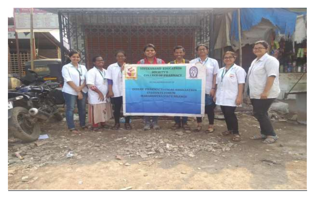
Walk for Freedom -abolish slavery with each step -20^{\text{th}} October 2018