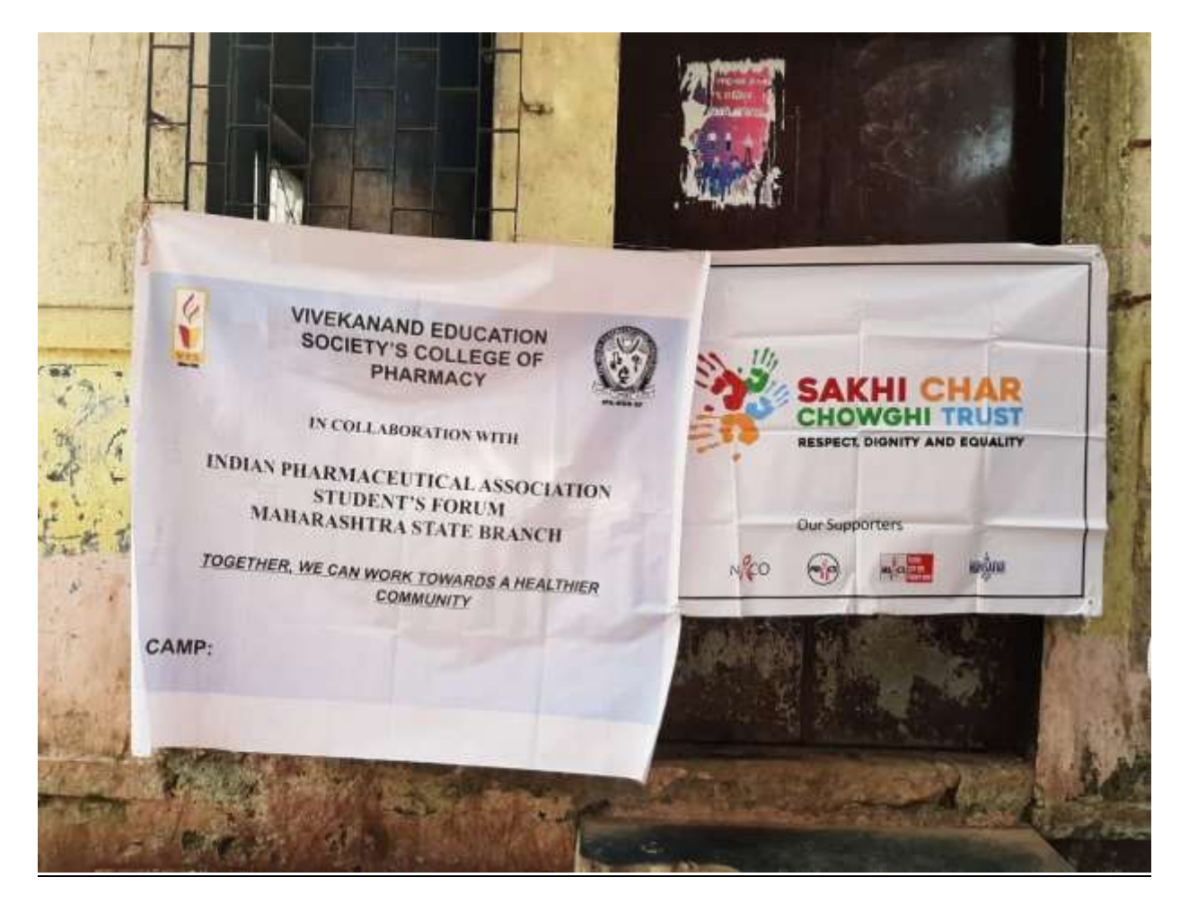
Antibiotic awareness campaign- 18th Nov 2019