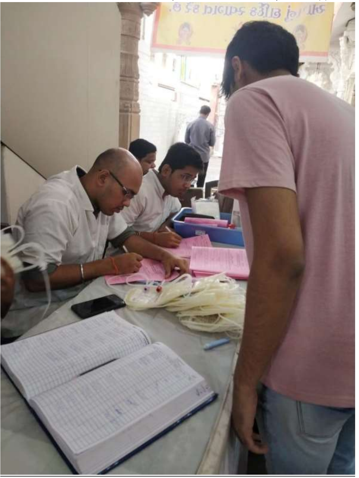
World AIDS Day Campaign – 1st December 2019