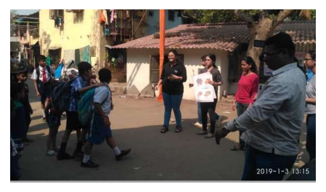
Menstrual Hygiene Camp – 9<sup>th</sup> January 2019