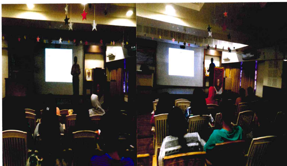
QA RA WORKSHOP