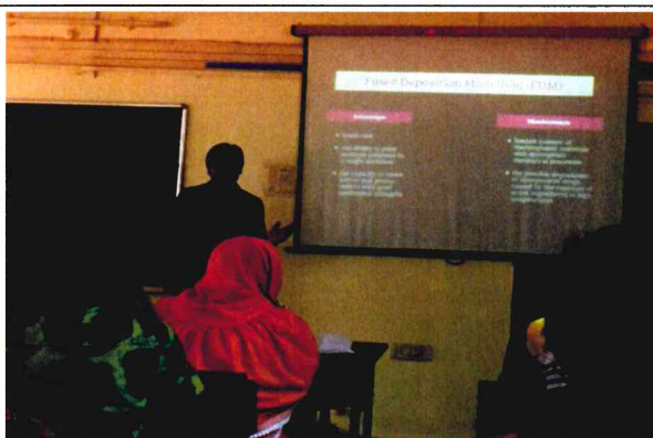
Journal club activity conducted for T. Y. B. Pharm students