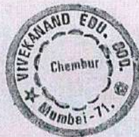
(Authorized Signatory) Vivekanand Education Society

Vivekanand Education Society's College of Pharmacy. 100 MBPS 1:1 BBL Rs. 41,000.00/- (GST Inclusive) Rs. 1, 64,000.00/- (GST Inclusive)