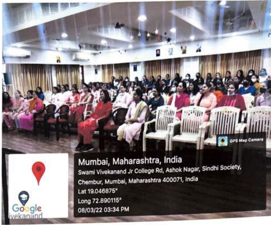
A glimpse of International Women's Day celebration